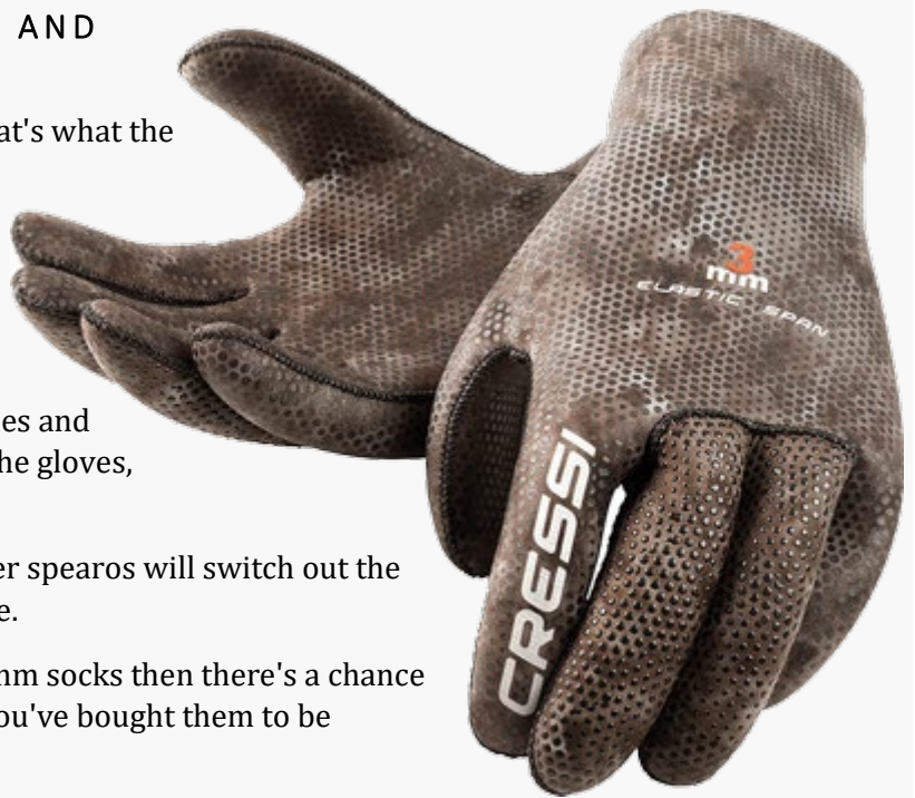
Above right: Cressi UltraSpan Tracina Gloves 3mm

You'll find most people wear something like crocs to walk to the beach and back. If you're walking in just your neoprene socks from the car park to your dive spot, you'll go through a couple of sets in a season if you're a regular diver. Get crocs or something similar - you can wear those to walk to your dive spot, clip them to your float and your socks will suffer less wear.